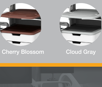
TABLE TOP OPTIONS