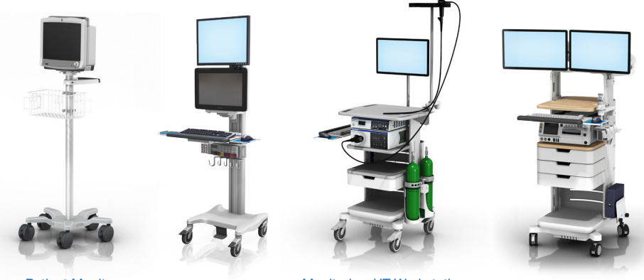
Monitoring / IT Workstations

FIXED AND VARIABLE HEIGHT MOBILE SOLUTIONS FOR A VARIETY OF MEDICAL DEVICES AND IT HARDWARE FOR EMR.