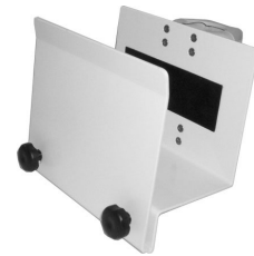
CPU Mount (with Clamping Blocks)

Tools Required: Phillips screwdriver, 3/16" hex wrench (provided).