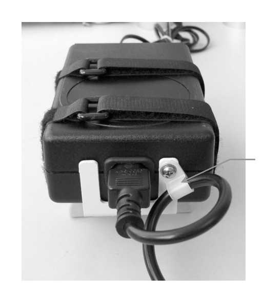
Nylon Retainer #8 Flat Washer #8-32 x 1/4" PHMS

3. Fasten Clamping Blocks to Roll Stand Post with two (2) #10-32 x 9/16" PHMS (below). Installation Note: The power supply mounting position is determined by the application. Mounting shown below is typical for many applications but not required.