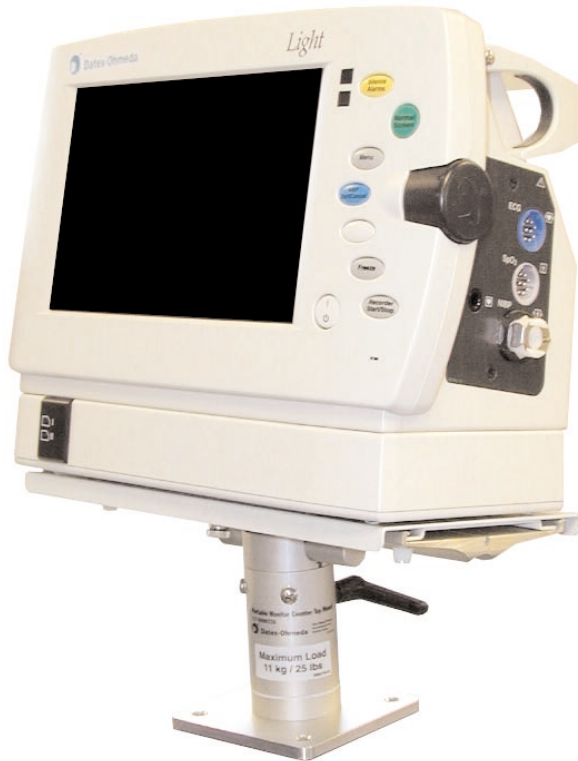
Light monitor mounted on a counter top mount, P/N: 8000726. Requires Datex-Ohmeda supplied mounting adapter, P/N: 890915.