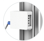
USB CHARGING MODULE (OPTIONAL)