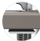
UP / DOWN RELEASE