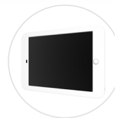
MOUNTABLE TABLET ENCLOSURE (OPTIONAL)