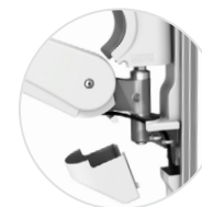
ENCLOSED CABLES AND PIVOT POINTS