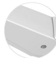
SEAMLESS, UNIBODY CONSTRUCTION